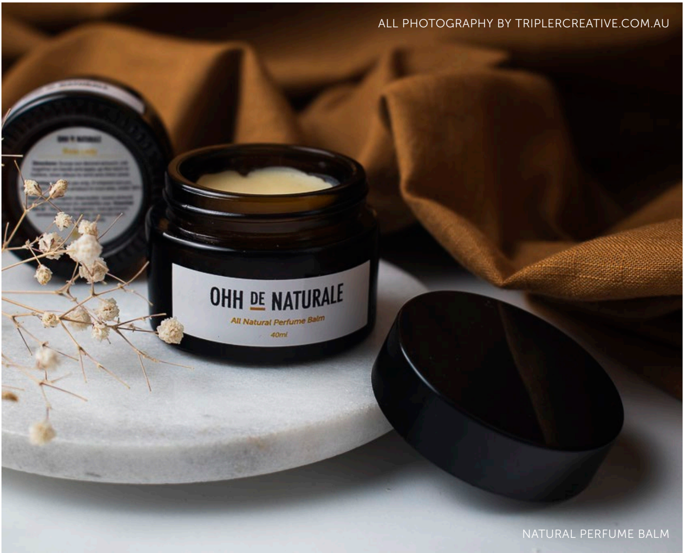
NATURAL PERFUME BALM