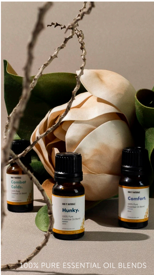
100% PURE ESSENTIAL OIL BLENDS