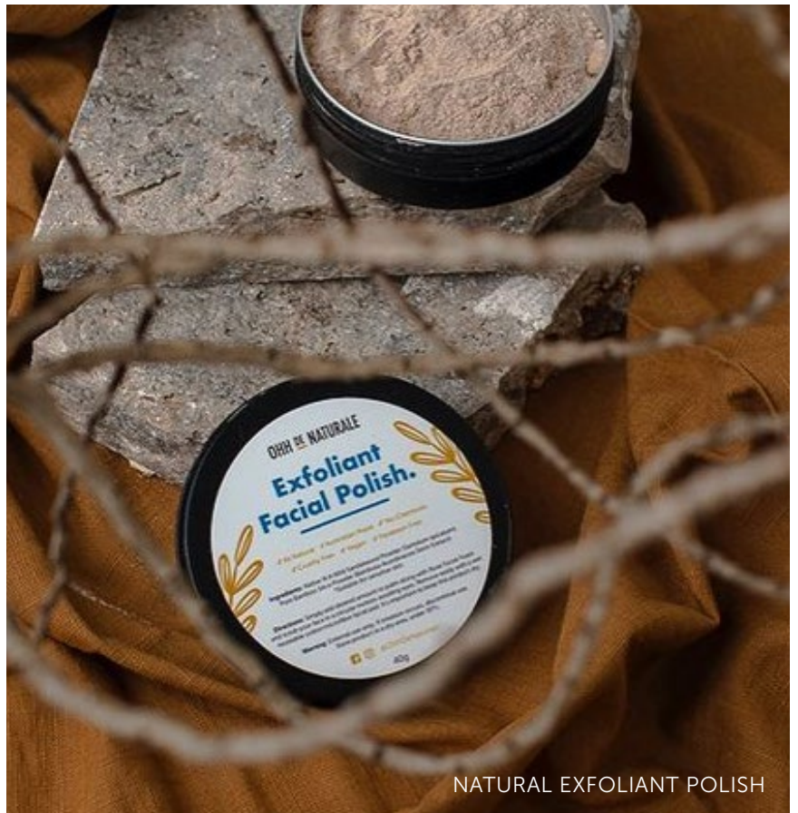
NATURAL EXFOLIANT POLISH